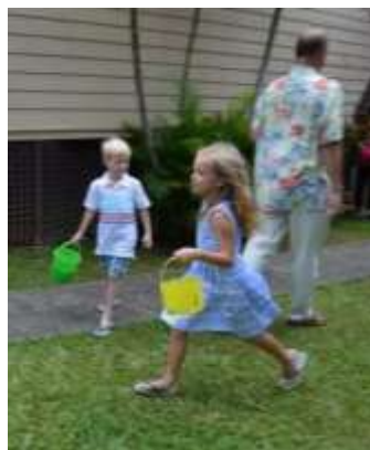
Below: Prior to the brunch, the keiki were treated to an Easter Egg Hunt compliments of the Family Ministries team.