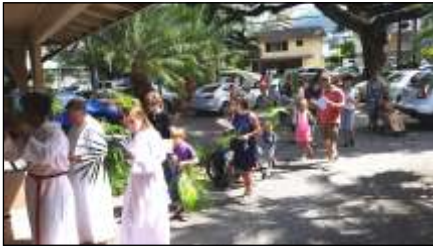
Above and right: Palm Sunday procession into the church.